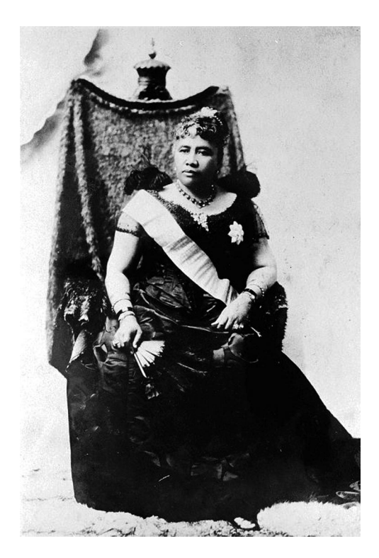
Figure 4. Queen Lili'uokalani.

races using the volume of the cranial cavity as his measure (Gould, 1996). This research was used to provide empirical evidence of the mental worth of human races, with the Caucasian group as having the highest mental worth, followed by Asians, then Polynesians (where Native Hawaiians were categorized), American Indians, and lastly African Americans (Morton, 1849 as cited in Gould, 1996). Morton failed to take into account gender, body type, nutrition, and various other confounding variables that would impact the volume of the cranial cavity. This was the beginning of 100 years of research comparing Native Hawaiians to other racial groups in the United States to demonstrate this indigenous group's "inferiority."