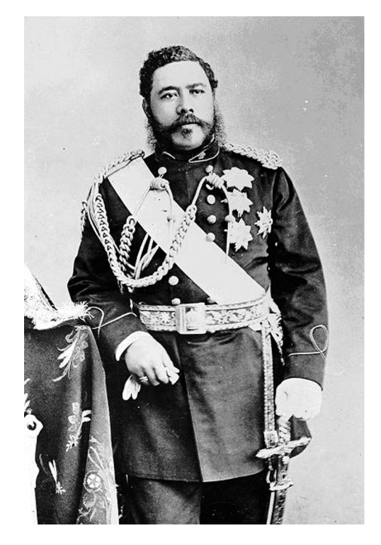
Figure 3. King Kalakaua.

Samuel George Morton, a leader among American polygenists, conducted one of the first research studies based on a deficit model. Morton's work ranked the mental capacity of different